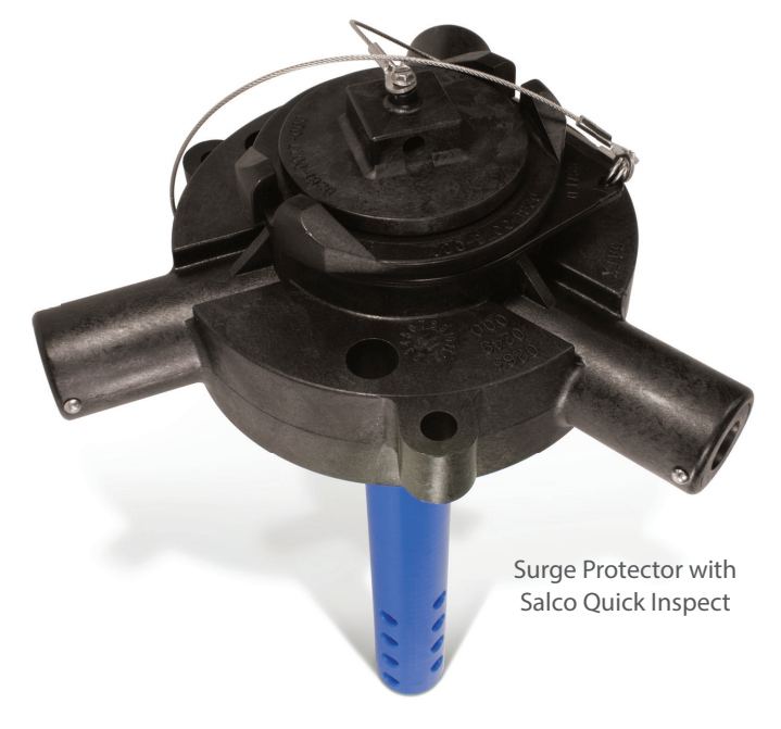
Part Number: OI261HSP03A

*Part numbers referenced are for images shown. Additional configurations are available.